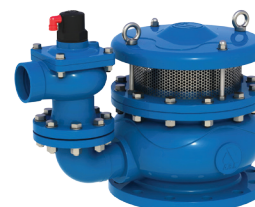
VB-060 + D-070

Please see the table below for all the additional air valve options available.